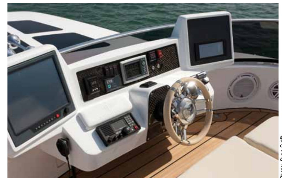
Top: The NISI 2400 at speed; Above: the flybridge helm.

“The fine entry at the bow enables NISI to cut through moderate waves without disturbing the cocktails”