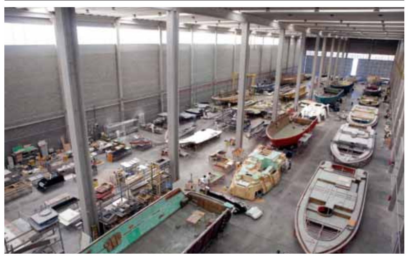
ABOVE & BELOW: FERRETTI BRAZIL'S NEW FACILITY IN SÃO PAULO.